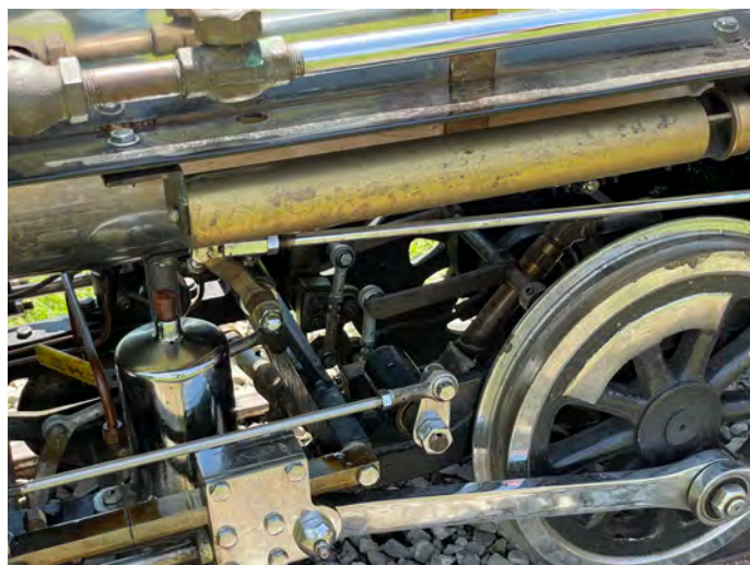
I was trying to get a shot of the Stevenson-style valve gear.