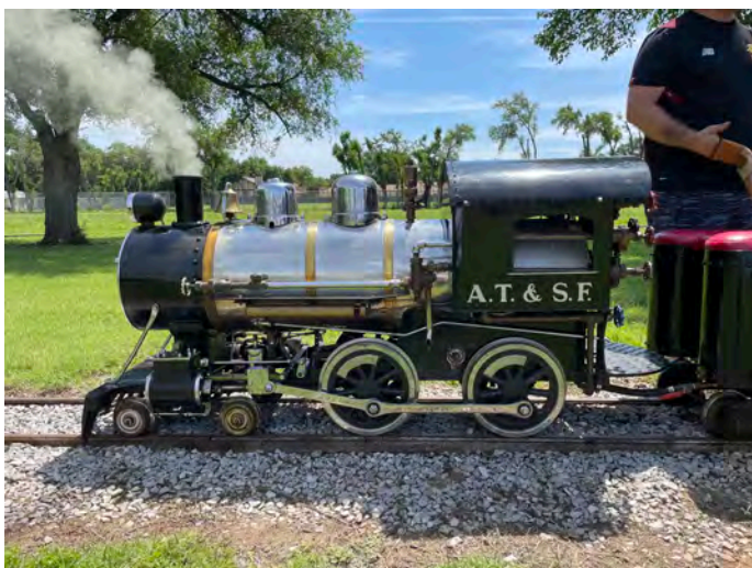
The vintage Ottaway steamer in all its shining glory. This one is still in the family.

If you aren't familiar with the Ottaway steam locomotive, it was manufactured by the Ottaway Amusement Company here in Wichita. This eventually became Chance Manufacturing. A good deal more information and a much better history can be found at this web site: http://www.ottawaysteam.org/