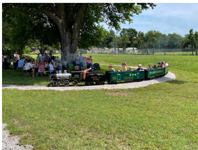
The train rounds a curve with yet another Ottaway descendent at the throttle.