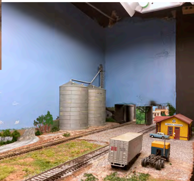
(Right) Liberty, KS looking north toward Cherryvale. Note the highway blended into the backdrop and the curve sign.