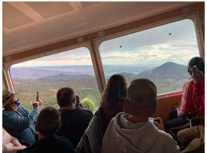
This view of Colorado Springs looks like you could almost see Kansas. (Ha!)