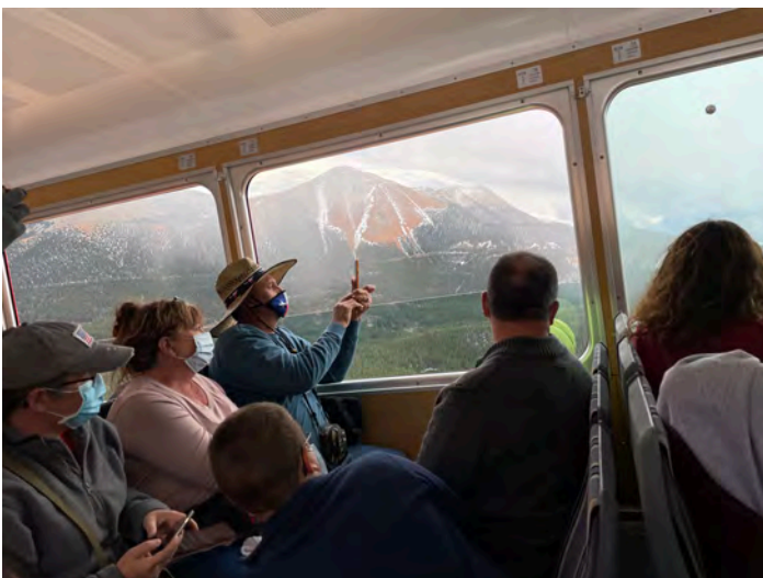
This is NOT Pikes Peak; it is Mt. Almagre, the second highest peak in the area. The angle of the car is no illusion. Don't drop your water bottle.