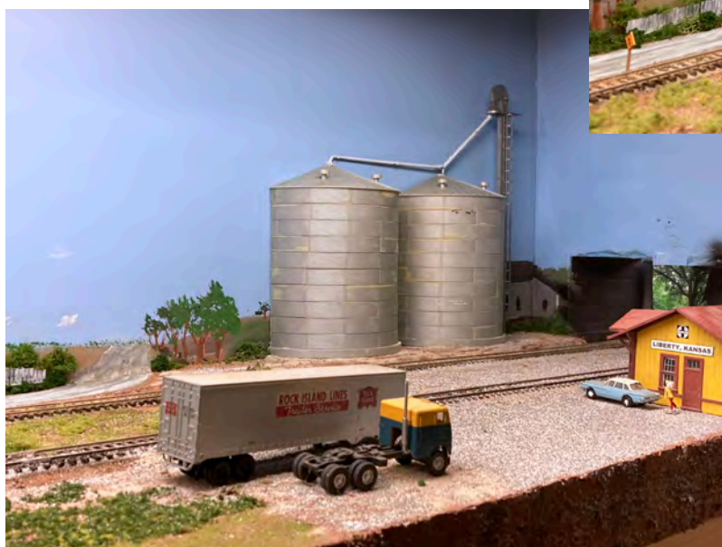
(Left) Liberty, KS depot and grain storage. Again, note the highway blending into background.