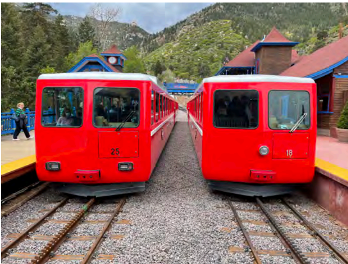
New modern cars on new rails waiting at the station. Notice the metal ties and modern attachments.

A family trip to Colorado Springs gave us the chance to ride the very recently reopened Pike's Peak Cog Railroad. Closed for three years for a complete rebuilding with totally new equipment, it reopened May 27. We rode it on June 1. Unfortunately, the tracks had iced over at the top, so we had to stop at Windy Point, short of the summit. That was still plenty high. When the snow started falling, passengers opened their windows to catch a few flakes. I believe they said it was 22°F at the time. I pitied the few folks who didn't have jackets, but not enough to offer mine.