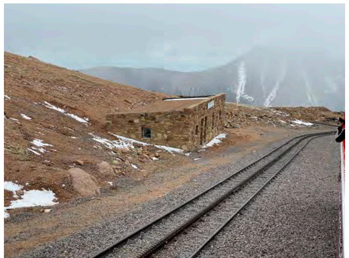
Windy Point was the end of our journey. Shortly after this picture was made, snow started falling in earnest to the delight of the passengers.