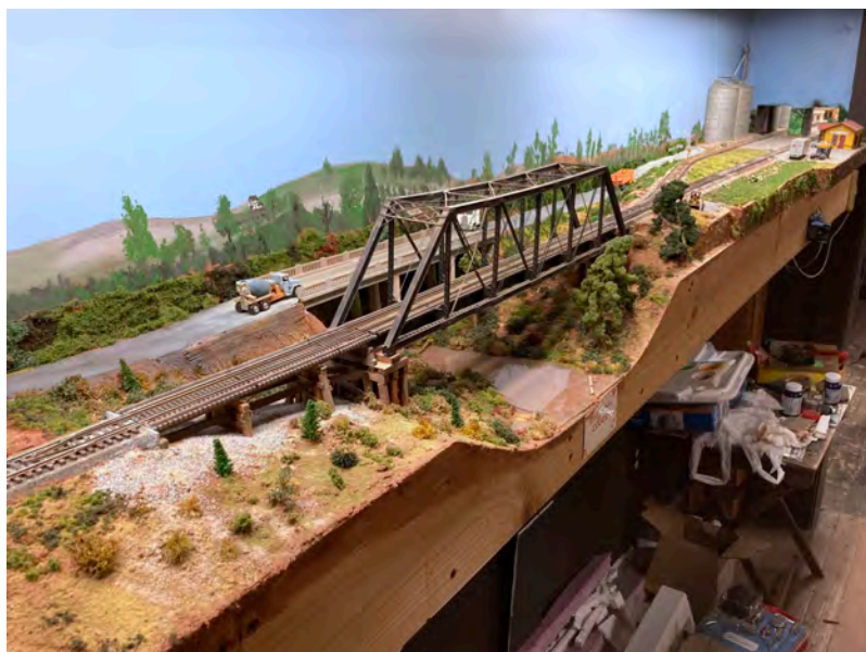
(Left) South end of Liberty, KS looking north from Big Hill Creek Highway and the Santa Fe railroad bridge.