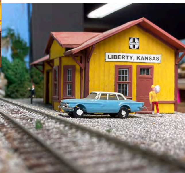
(Right) The station agent waves to every train.