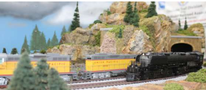
Trails, Rails, & Tales