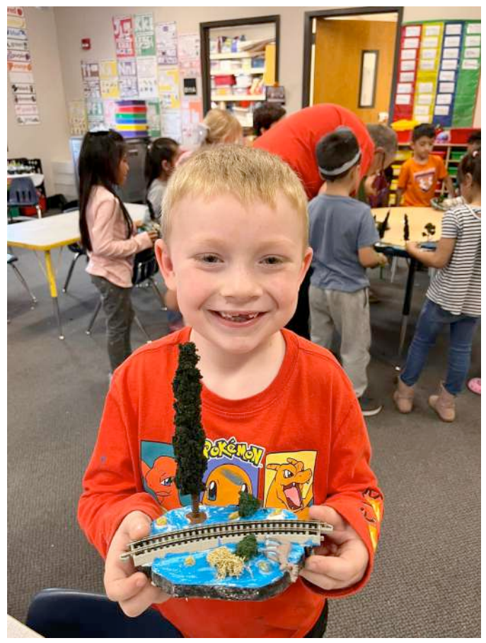
Trails, Rails, & Tales