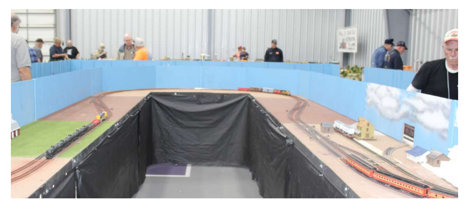
Trails, Rails, & Tales