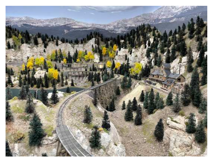
An abandoned mine scene on Jim Gray's layout. Jim uses photo backdrops to very effectively expand the perceived space of the layout.