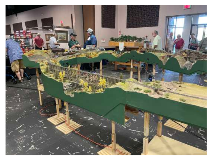
Among the numerous modular layouts was this one that featured all of the trestles of the famous Ophir Loop on the Rio Grande Southern.