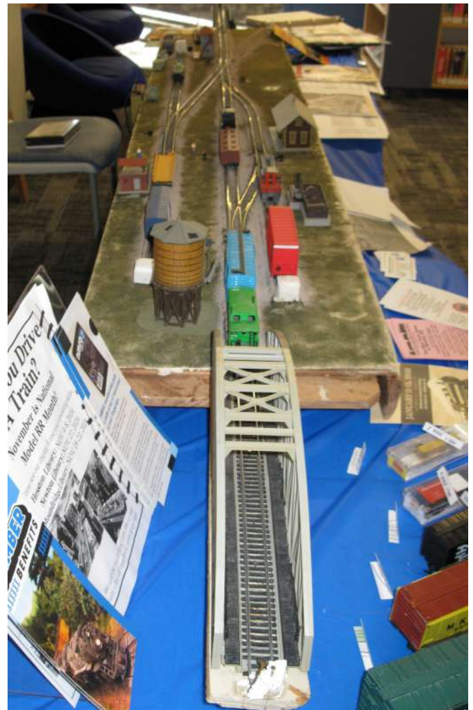
The layout "on stage" in the library with the large bridge that extends the main line.