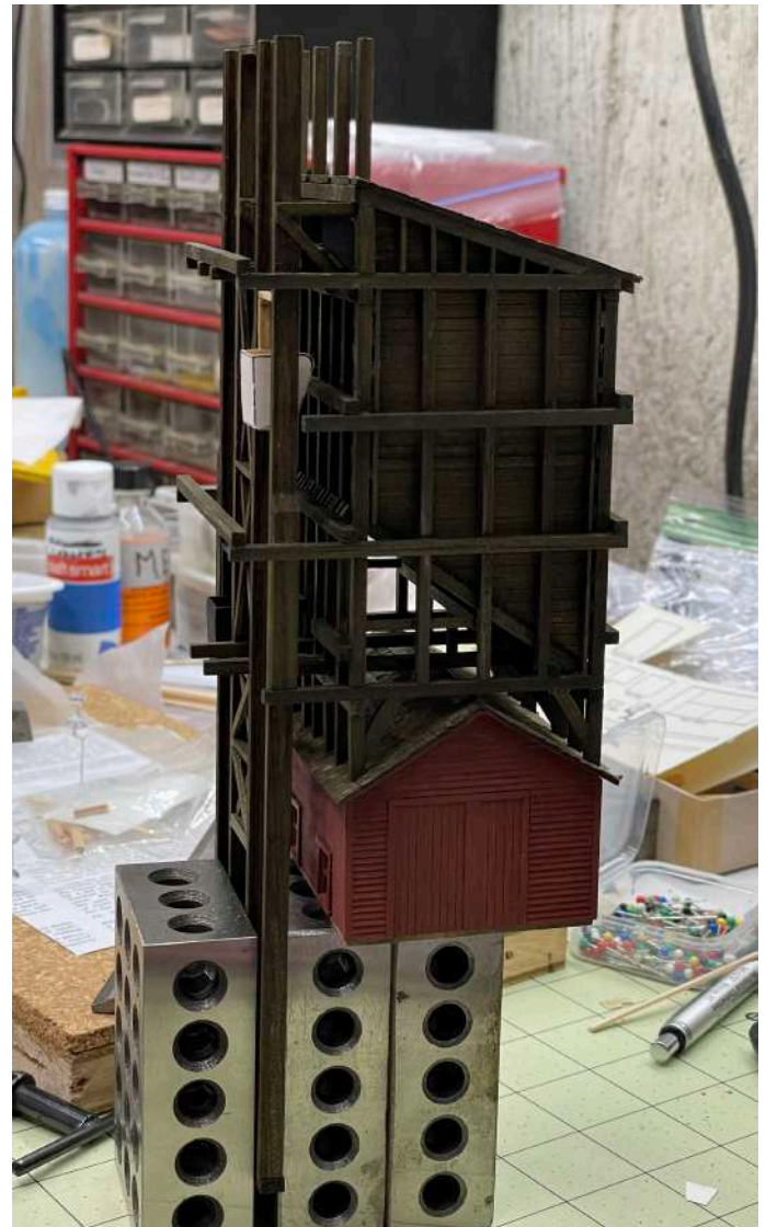
The coaling tower as it sits now. One bucket needs to be painted, then the dump mechanism, the lift cable system, the loft house at the top, the coal pits, the chute on the front side, and a whole bunch of ladders and platforms.