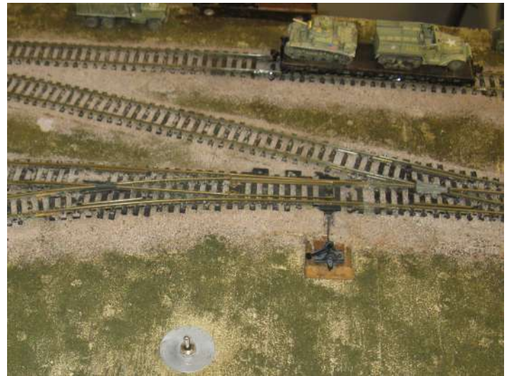
The manual ground throws for the switches and the simple forward, reverse, and center off switch for the throttle.