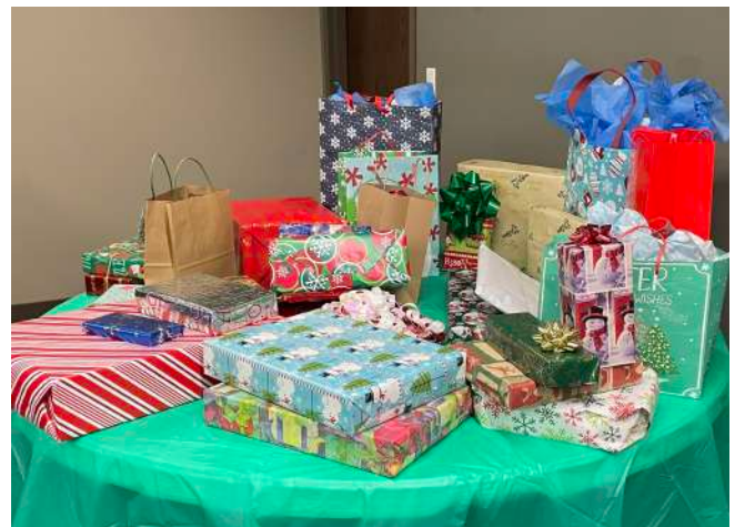
Below: The gift pile before it was winnowed down to nothing. Some people got just the right gift and others got a white elephant for next year, but I think we all had a great time.