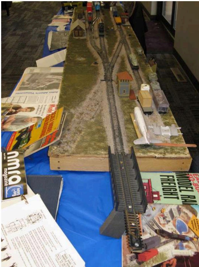
The smaller bridge that extends the mainline on the other end of the layout.