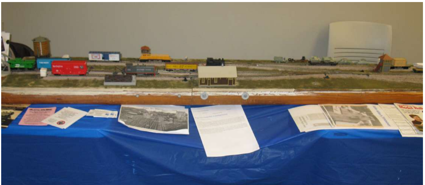
The layout from the front with literature promoting the hobby.